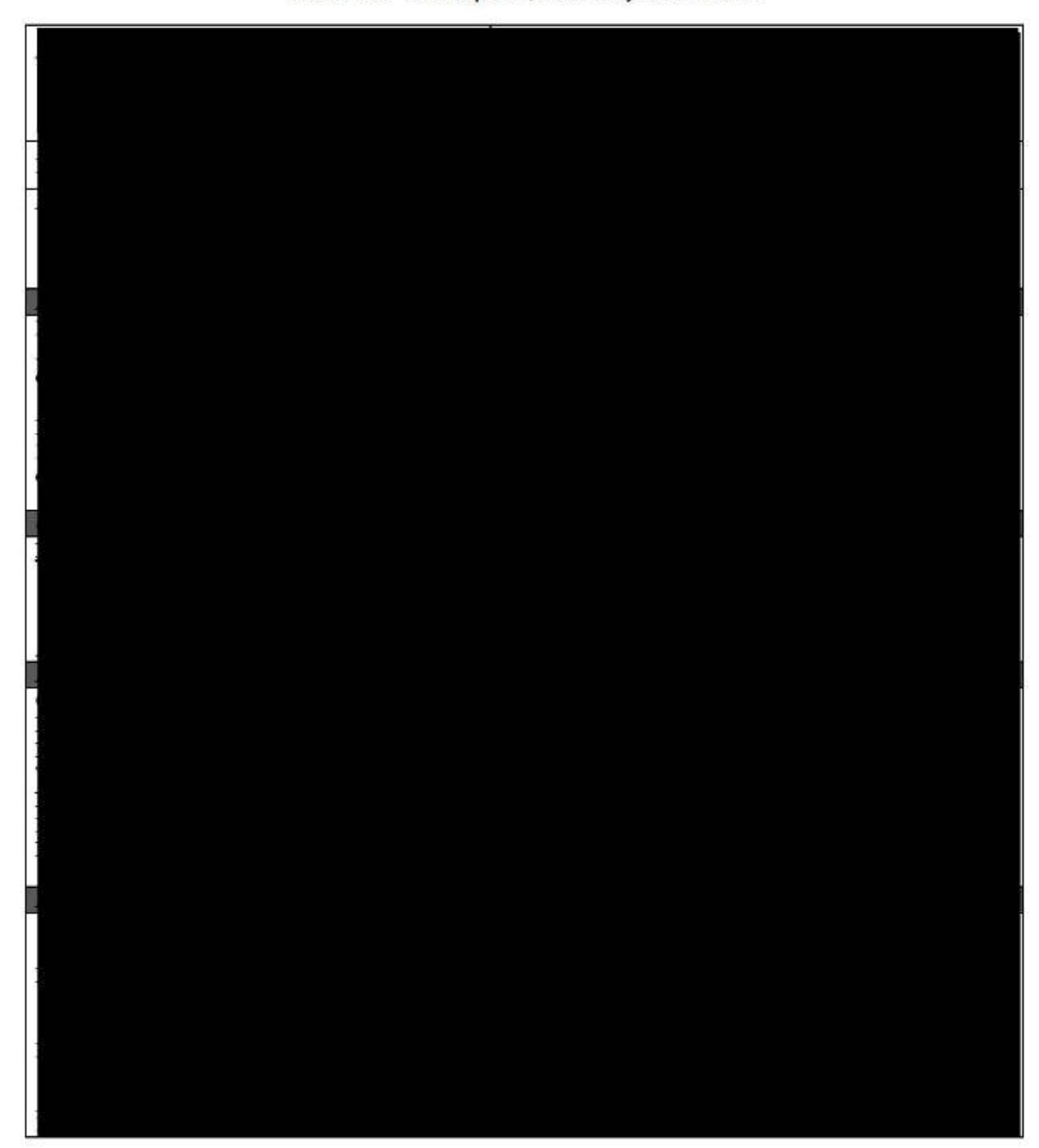
EXHIBIT A - Prescription / Pharmacy Intake Form